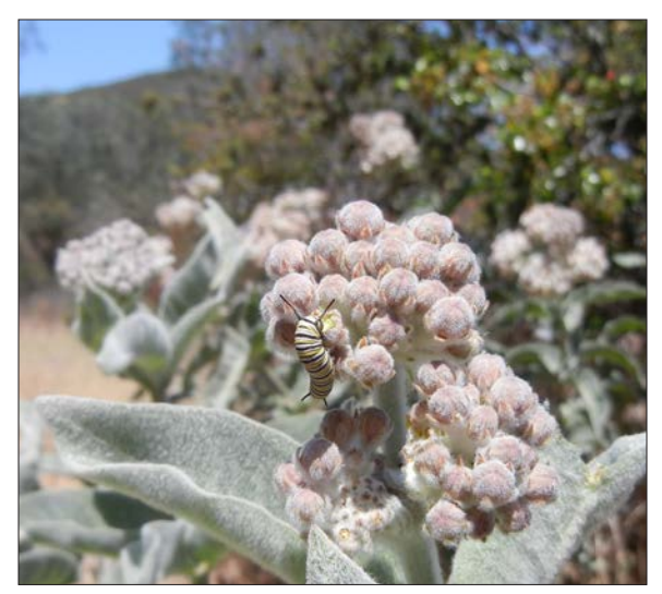
Woollypod milkweed (Asclepias eriocarpa), growing in southern California, provides food for a hungry monarch caterpillar.

Check out Xerces' Milkweed Seed Finder (xerces. org/milkweed-seed-finder) to locate native milkweed plant materials (seeds, plugs, plants) in your area, and Xerces' Western Monarch Milkweed Mapper (monarchmilkweedmapper.org) to see which species of milkweed grows in your area.