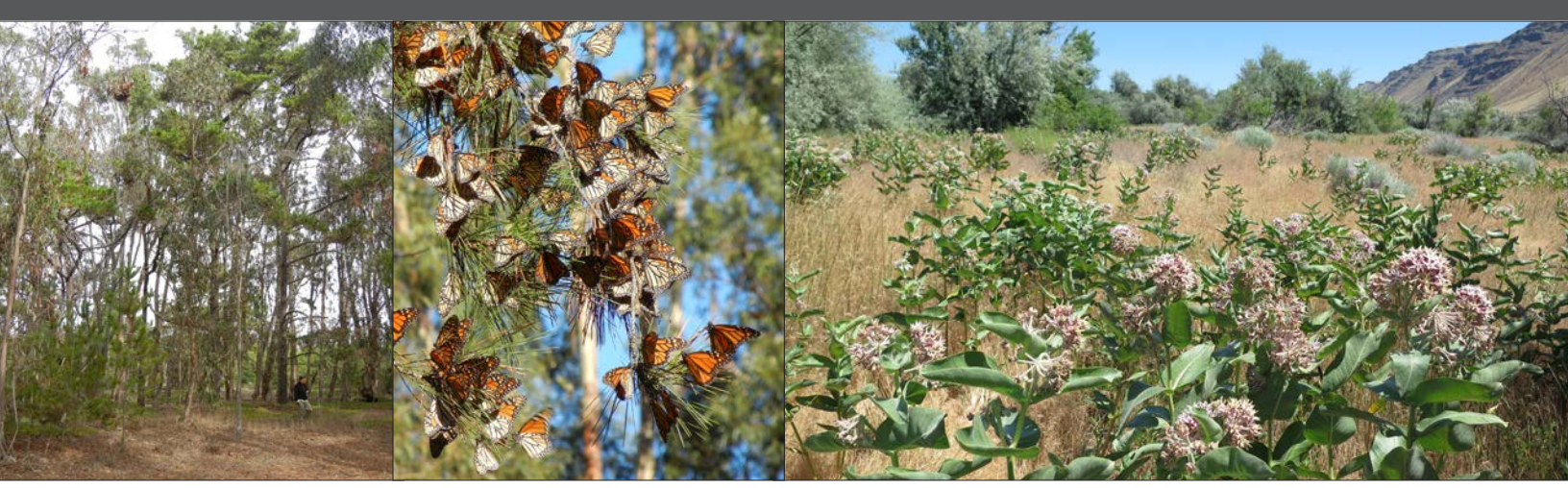
From the overwintering groves of coastal California to milkweed in the open sagebrush of eastern Washington, protection and management of habitats is urgently needed chance to save the western monarch migratory phenomenon.