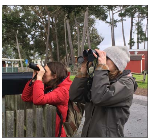
Valuable information can be gathered with little more than a pair of binoculars and a few hours of time.

If you live near an overwintering site and can make at least a 2-year commitment, consider joining the dedicated group of volunteers that